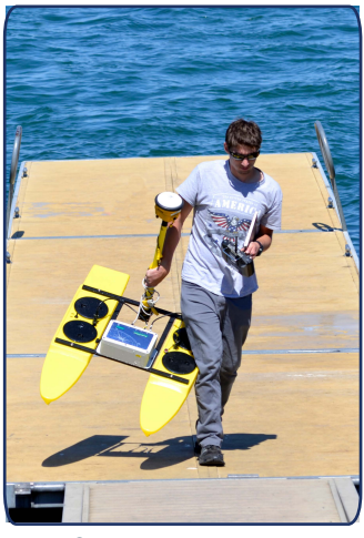
One Person Portable

This highly-economical platform provides the same survey results as more expensive remote-controlled systems.