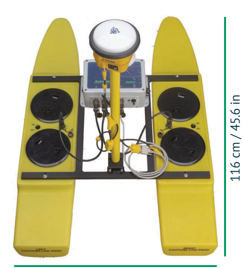
73 cm / 29 in